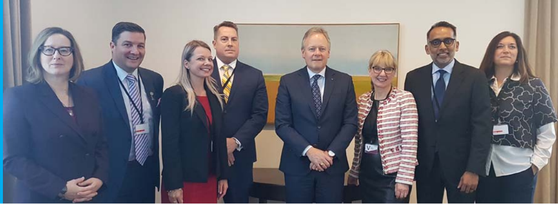
ITAC meets with Bank of Canada Governor Stephen Poloz and his team to discuss digital transformation, the need for ICT talent and cyber-securing the environment

ITAC advocates strenuously for fiscal measures that support research and development, robust capital markets, competitive personal and corporate taxes, and the appropriate retail tax measures.