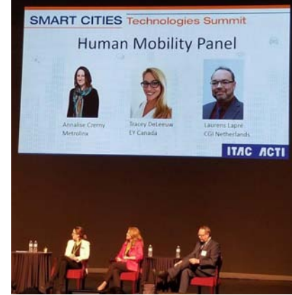
ITAC Smart Cities Technologies Summit: Panel Discussion