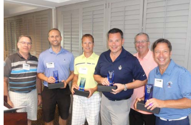
Winners in the 25th Anniversary "IT Challenge" ITAC Golf Tournament

ITAC events provide an opportunity for members to hear from industry thought leaders on key areas of interest to the ICT sector, including many of our priority areas such as cybersecurity, health, talent, procurement and more.