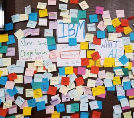
Student responses to "What are some core competencies?" and "What is AI?" at the 2018 Xplore STEM Conference