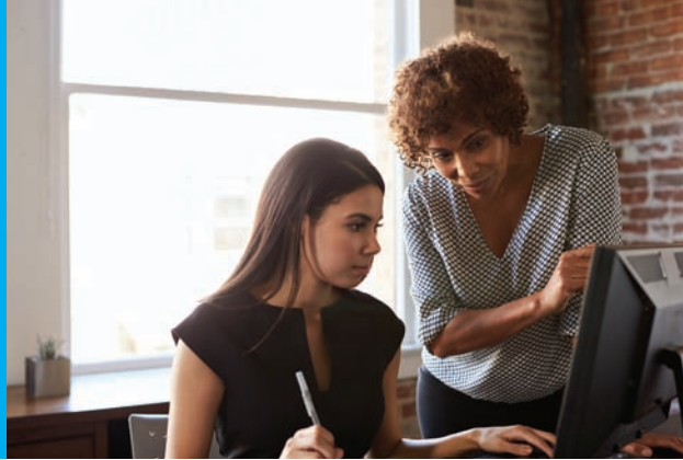
ITAC placed over 300 students across Canada this year, as part of the Government of Canada's Student Work Placement Program