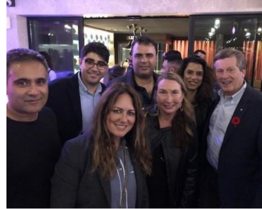
European Trade Mission: Participants with Toronto Mayor, John Tory

The 2018 Web Summit was held in Lisbon, Portugal in November 2018. Each year, Web Summit welcomes over 70,000 people annually and attracts the best of speakers and industry leaders from across the globe.