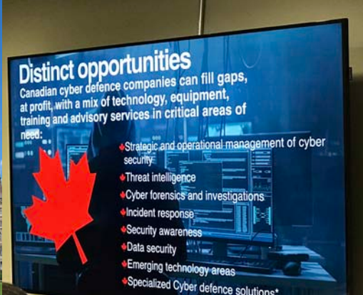
ITAC Cyber Forum: Cyber Ukraine