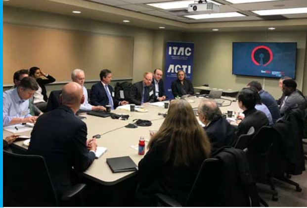
ITAC Cyber Forum: Cyber Ukraine