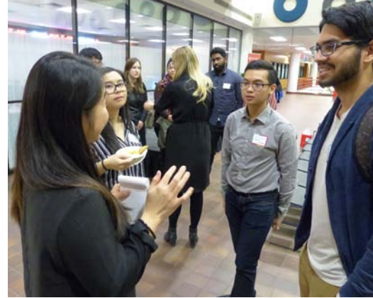
2018 Business Technology Management (BTM) TalentMash. To date, over 6,000 BTM students have participated